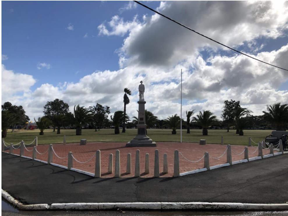
Katanning War Memorial