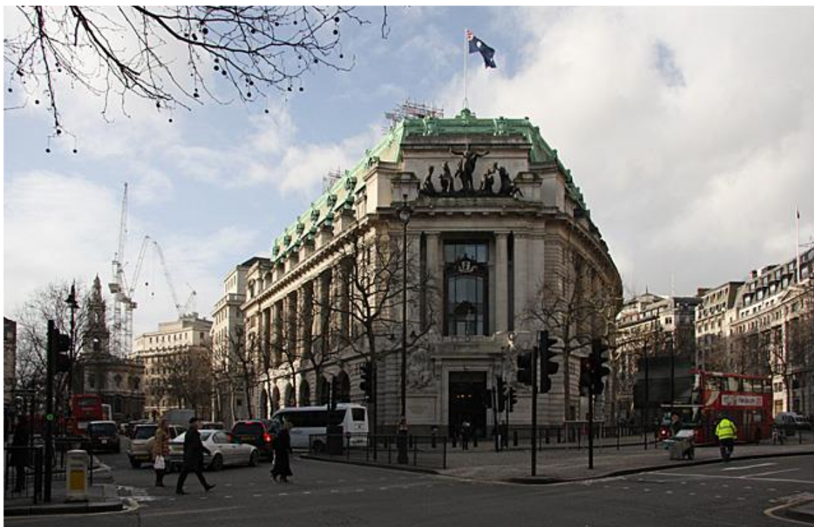
Australia House – Home of the Australian High Commission was officially opened by King George V in a ceremony on 3rd August, 1918.