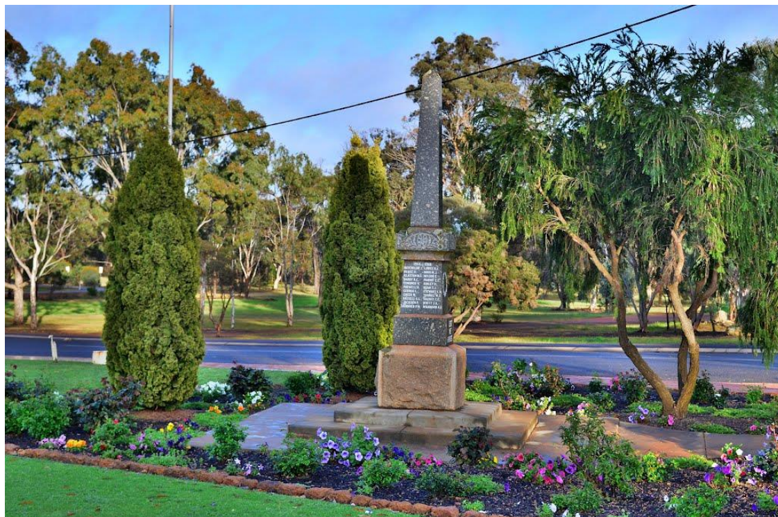
Broomehill War Memorial

R. C Darby is remembered on the Broomehill War Memorial which is located on the Great Southern Highway, Broomehill, Western Australia.