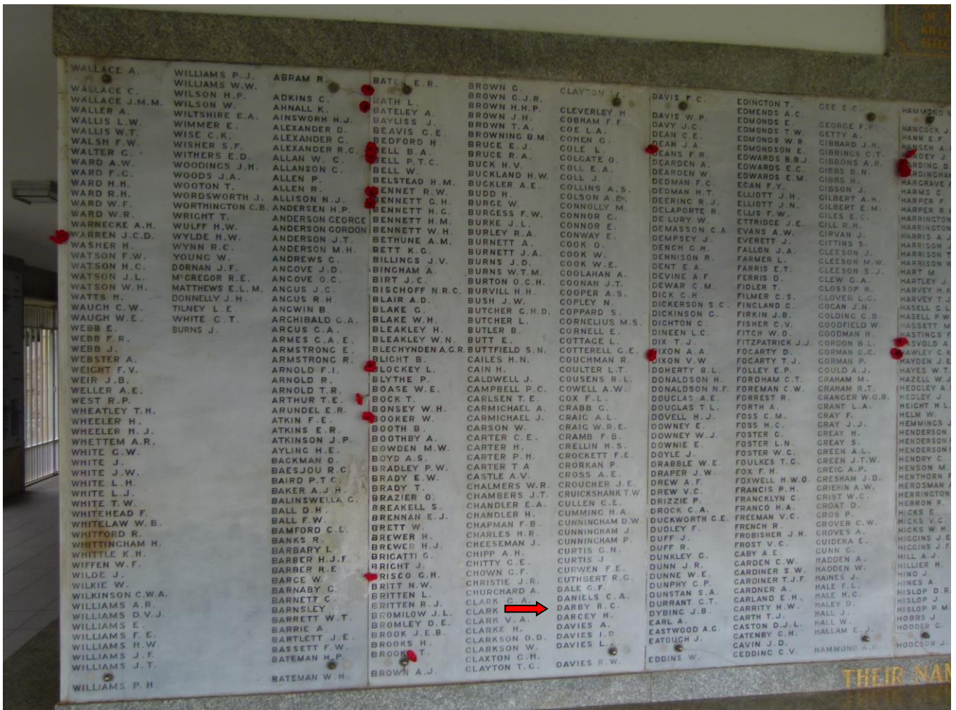
28th Battalion Panel